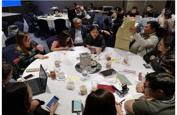
A Forum on Understanding Risk and Resilience attended by National Government Agency officials, Academe, Non-Government Organizations (NGOs) in celebration of the Oct 12 International Day for Disaster Reduction

ARISE Philippines will support and engage local business communities and governments to increase awareness of and understanding for improving disaster resilience in the urban and built environment. It will address critical infrastructure and basic service delivery, transportation, energy and utilities services, and undertake informed risk-sensitive planning and facilitate public-private partnerships (PPP) and collaboration to address gaps in disaster risk management to meet Theme 6: Urban Risk Reduction.