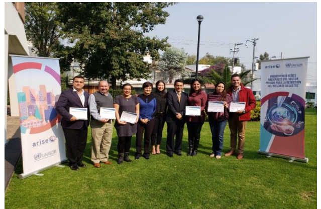
Image 3: Business Plans to Reduce Disaster Risks Workshop

After the launch event, in collaboration with the UN Regional Office for DRR for the Americas and the Caribbean, the Network held a workshop for the Private Sector to develop Business Plans to Reduce Disaster Risks. This will be the first of several to be held in different regions of Mexico.