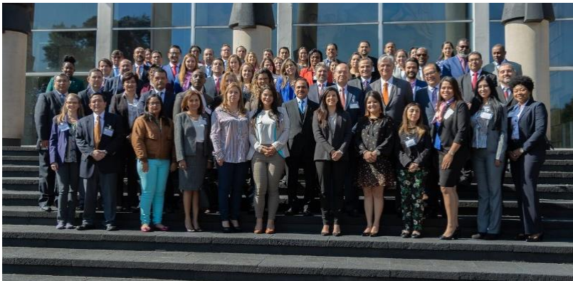
Image 1: Inaugural Session of the VII SELA Encounter for Public-Private Alliances

ARISE MX was launched on 22 November during the event VII Encounter for Public and Private Alliances to Reduce Disaster Risks in Latin America and the Caribbean. This event was held with the partnership of SELA, BMZ, CISS, UNDRR-Americas and the Caribbean and CEMEX, with the attendance of 70 regional participants.