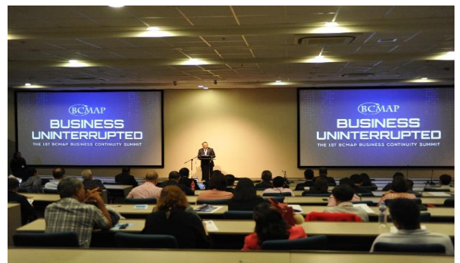
The 1st Business Continuity Summit: Business Uninterrupted, co-sponsored by ARISE Philippines, was held in Manila, Philippines and attended by 150 Business Continuity practitioners, private sector and local government units (LGUs)

To address Theme 1, ARISE Philippines will build partnerships between public and private sectors to assess disaster risks and develop appropriate risk management strategies and plans. Management strategies include preventing the creation of new risks through risk-sensitive investment, reducing existing risks through corrective actions and strengthening resilience through Business Continuity Planning (BCP) and insurance.