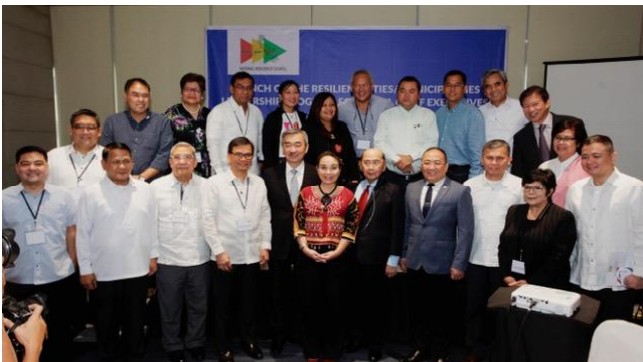
Sen. Loren B. Legarda, together with national and local government officials, during the launch of the Resilient Cities/Municipalities Leadership Program for Local Chief Executives