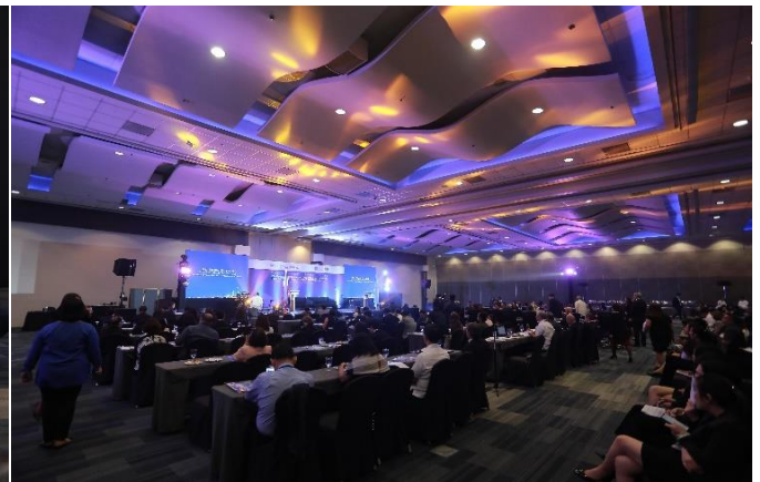
2018 Top Leaders Forum: "Changing the Game: Building a Culture of Resilience through Public-Private Partnership" was attended by UNDRR Executives and Officials, ARISE, International Organizations, Private sector/businesses, Philippine government's national and local government officials.

To address Theme 1, ARISE Philippines will build partnerships between public and private sectors to assess disaster risks and develop appropriate risk management strategies and plans. Management strategies include preventing the creation of new risks through risk-sensitive investment, reducing existing risks through corrective actions and strengthening resilience through Business Continuity Planning (BCP) and insurance.