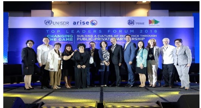
The National Resilience Council's (NRC) Local Government Units (LGUs) partners during the 2018 Top Leaders Forum.