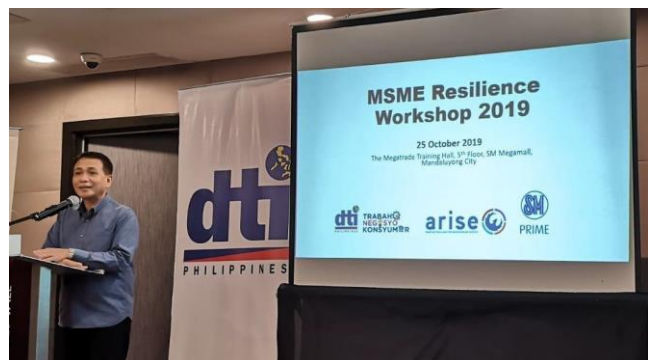
The 1st MSME Resilience Workshop was held at the Megatrade Training Hall, 5 th floor, SM Megamall, Mandaluyong City with 100 participants.

UNDRR ONEA-GETI conducted a two-day DRR workshop entitled The Business Case for Disaster Risk Reduction: Achieving Resilience of Small and Medium Enterprises for SM Prime Holdings’ SMEs from 21-22 February 2019 held at Meeting Room 7, SMX Convention Center Manila with total participants of 61 from 31 private sector partners. Moreover, year-round Business Continuity Planning (BCP) orientation was also conducted to encourage SM Tenants to create their own BCPs to help them prepare for times of disaster. ARISE Philippines partnered with Department of Trade and Industry (DTI) to conduct the first of many workshops on SME Resilience, with a focus on risk assessment. The goal of this is to strengthen the resiliency of SM Prime Holdings tenants and other SMEs all over the country so