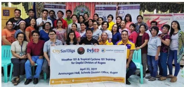
WPF conducted Weather 101 & Tropical Cyclone 101 Training for DepEd Division of Ifugao last April 23, 2019 at Ammungan Hall, Schools Division Office, Ifugao

ARISE Member Weather Philippines Foundation (WPF) of Aboitiz Group also continued to lead Weather 101 and Tropical Cyclone 101 trainings for different LGUs and national government agencies. With their own mobile app available for download on the app store and on google play, users can have access accurate five-day weather forecasts anytime.