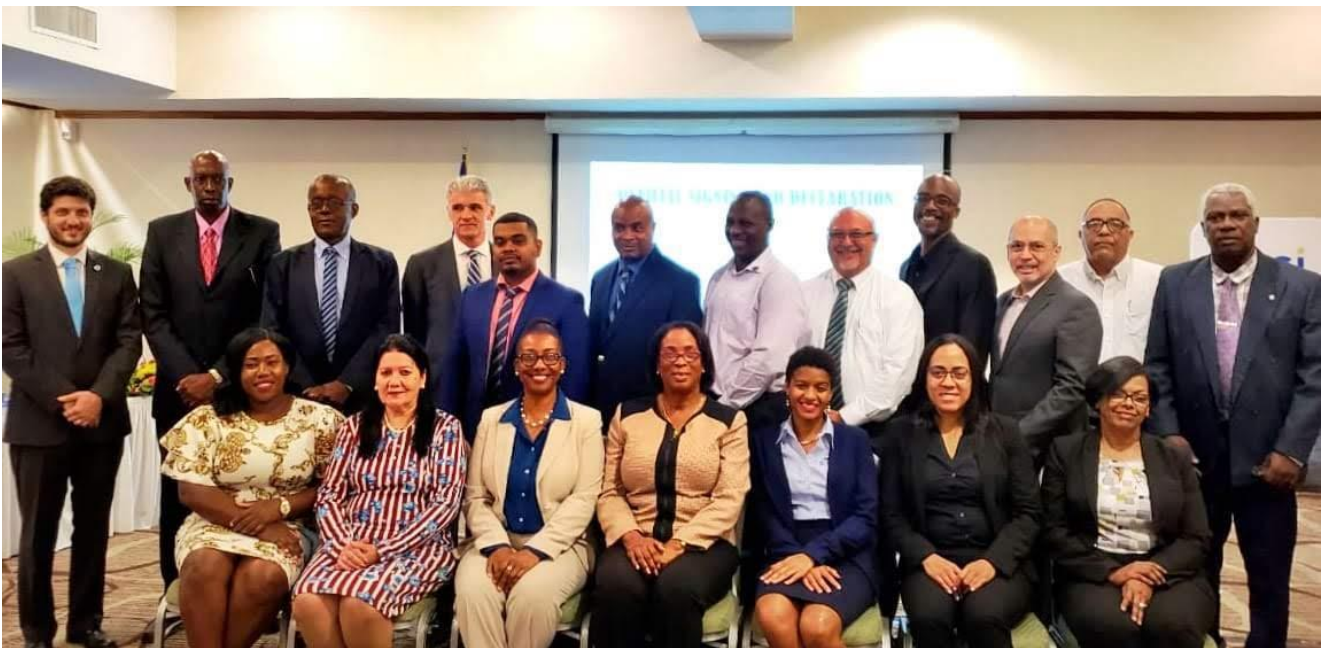
Representative from the 16 Chambers of Commerce: Signatories were from Antigua and Barbuda, Barbados, Belize, Cuba, Dominica, Grenada, Guyana, Haiti, Jamaica, Martinique, St Kitts and Nevis, St Vincent and the Grenadines, Saint

The plan is in line with the Sendai Framework and ARISE commitments and reflects the region’s specific needs and opportunities.