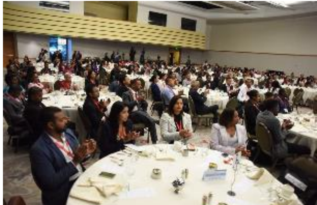
The ARISE Trinidad and Tobago network was launched in front of over 300 high-level representatives from the public and private sectors and the Academia.

Information gathering: AMCHAM T&T is working with local, regional, and international partners to assist companies in increasing their resilience to COVID-19 and any other pandemics, particularly through information sharing and exchanges. This included a series of webinars on COVID-19 and Business Continuity Planning, in particular the use of technology as a business continuity tool. Other webinars will be on Mental Health and Well-Being, Business Continuity Planning, Cyber Security, Risk Assessment etc.