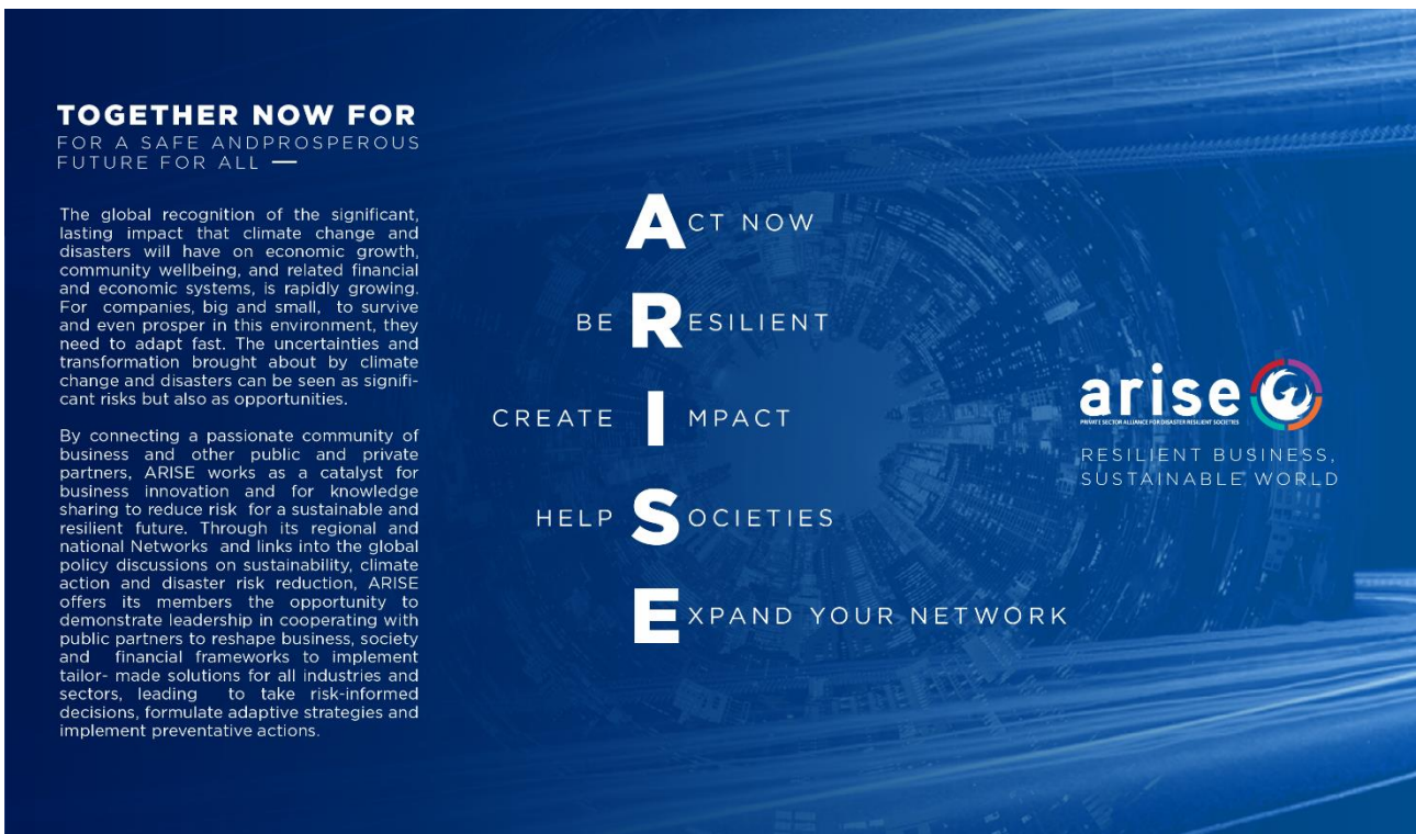
ARISE Value Proposition 2020

I congratulate the Board on their hard work to see these important developments through and look forward to welcoming the new ARISE Board in July to drive forward the four priorities; I look forward to further developments as ARISE networks and membership continues to grow globally, particularly in Africa, Arab states and Europe.