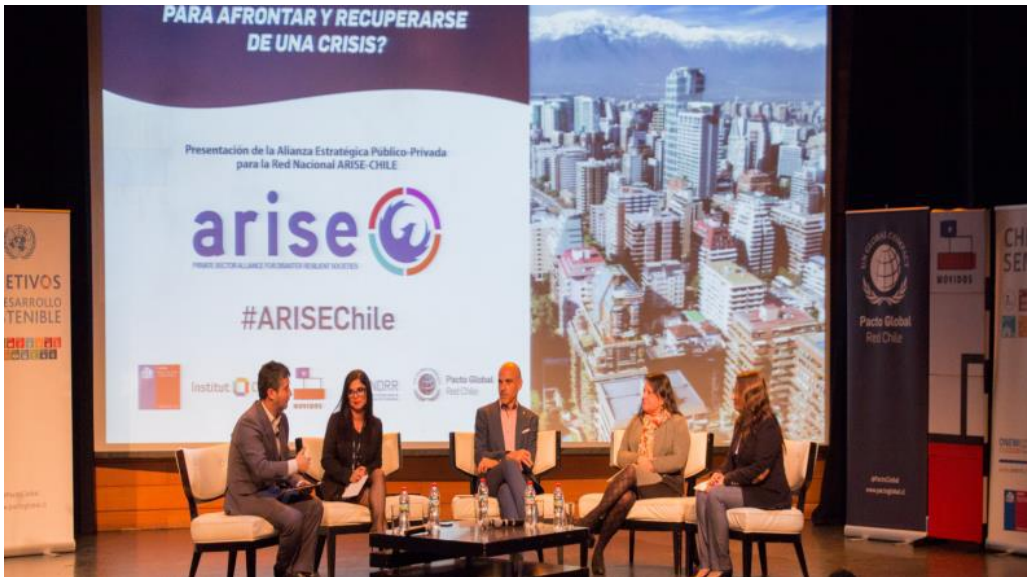
UNDRR, ONEMI, Global Compact, Institut Cerda and Movidos por Chile, signed the agreement.