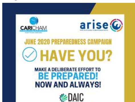
Figure 6. Public campaign promoting prevention and business continuity measures.

The aim was to reduce potential risks during the second quarter of the year. The campaign was followed by member meetings to share good practices, linked with the CARICHAM webinar series.