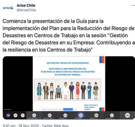
3:41 pm - 18 Nov 2020 - Twitter Web App Figure 21. Announcement on the presentation of ARISE Chile's 'Business Resilience Guidance for DRR'

Chile. In 2020, ARISE Chile launched a Business Resilience Guideline and promoted the exchange of good practices among public and private sector companies (see Fig. 21). Thus, with UNDRR's support, ARISE Chile organized a virtual session with members of the national platform for DRR to: