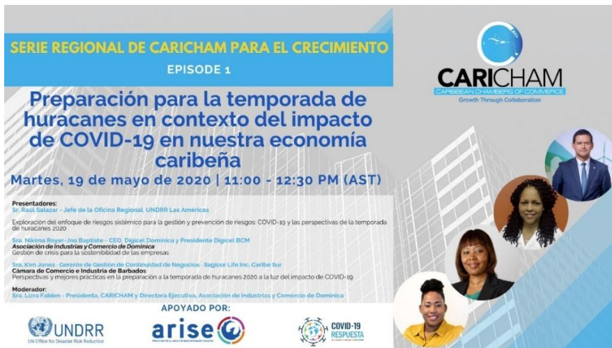
Figure 5. Launch of episode 1 of ‘CARICHAM’s Regional Growth Series’

ARISE Network of Chambers of Commerce from the Caribbean Community Network (CARICHAM) organized a series of webinars titled “ CARICHAM Regional Growth Series ” to promote business resilience in response to the impact of COVID-19. The first series which was launched in coordination with UNDRR and conducted in collaboration with ARISE Barbados, focused on the preparedness to the cyclone season (see Fig. 5), engaging both the private and public sectors in introducing measures to reduce risks and gain a better understanding of the systemic nature of risks.