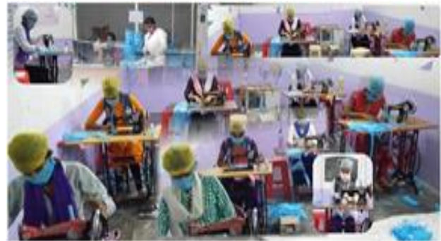
Figure 27. Mask Production

ARISE India has also been working with partners to directly help those who have been hit hardest by the pandemic's economic consequences. According to a survey conducted by ActionAid India, more than 75% of informal workers lost their livelihoods since the COVID-19 lockdowns started. In addition to providing food and assistance to hundreds of thousands of people, ARISE India members and partners have been supporting a number of initiatives to help alleviate poverty and foster sustainable development. One