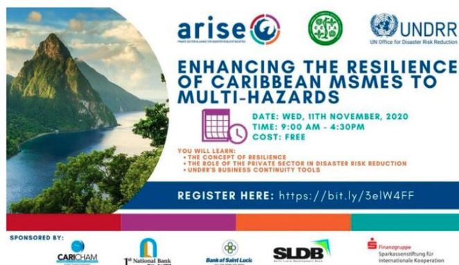
Figure 8. 'Enhancing the Resilience of Caribbean MSMEs to Multi-hazards' E-Symposium announcement

Following the ARISE Saint Lucia Network launch, the Network has continued to work hand in hand with the public sector through the National Emergency Management Organization to align its workplan and to promote the private sector's resilience with a focus on SMEs. In 2020, in close coordination with UNDRR and CARICHAM, ARISE Saint Lucia conducted an E-Symposium (see Fig. 8) for its members. Specific training on understanding of risk, business continuity, and disaster risk reduction was provided to businesses, recognizing their key role in ensuring a quick and resilient economic and social recovery.