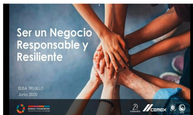
Figure 15. Announcement of support towards business resilience and responsibility