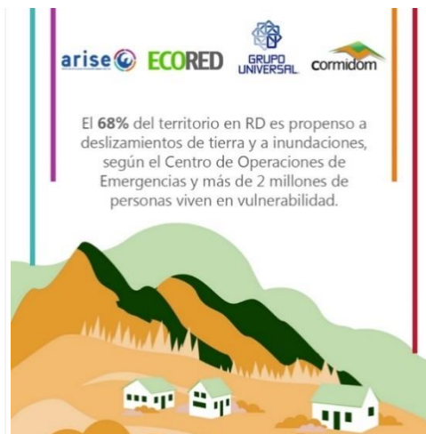
Figure 13. Announcement on ARISE’s national workplan initiative. Figure 14. Informative flyer on DRR.