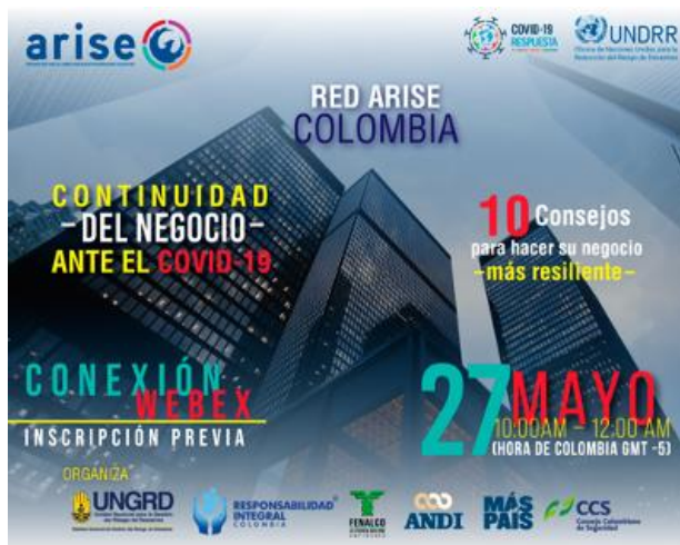
Figure 24. Webinar flyer on Business Continuity in the context of COVID-19

Additionally, ARISE Colombia focused on resilient business recovery from COVID-19. For example, on 27 May 2020 the Network organized a webinar on business continuity in the context of COVID-19 and presented a tool developed by UNDRR (see Fig. 24). The webinar aimed at providing the business sector with key information on how to protect their business from the future impacts of the pandemic. Another webinar on business communication during crisis was conducted in October 2020, with high participation of 800 attendees.