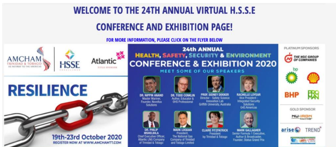
Figure 10. '24 th Annual Virtual HSSE Conference & Exhibition' flyer.

Risk Reduction and ARISE. During this session, UNDRR focused on the role of the private sector in achieving the Sendai Framework through risk-informed investments, while other panelists presented insurance, sustainability, climate financing, and other mechanism to promote resilience. The event became an opportunity for sharing information, encouraging best practices, and engaging the public sector in disaster risk reduction discussions from the business sector's point of view. In line with ARISE Priority on SMEs, AMCHAM T&T in collaboration with the Office of Disaster Preparedness and Management, started the process of identifying small businesses to be part of a Training of Trainers (TOT) to further train and support resilience of SMEs.