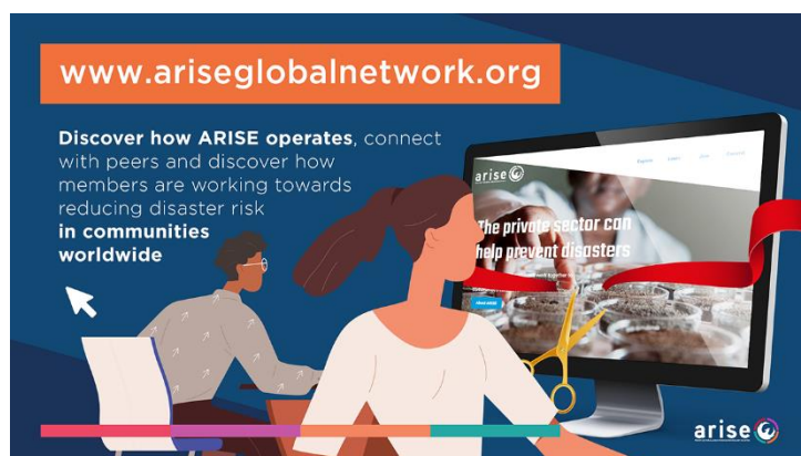
Figure 1. New makeover to the ARISE website.

Throughout 2020, the ARISE website was redesigned a new, interactive, fresh interface and benefitted from direct input from ARISE members, some global Board members as well as the wider ARISE community to address specific objectives including: