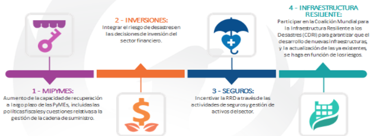
Figure 26. ARISE MX Working Group overview on ARISE's priorities

For 2021, ARISE Mexico has identified three main lines of action: