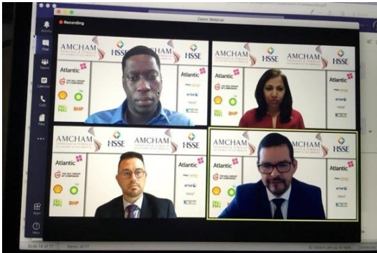
Figure 9. Virtual HSSE conference & exhibition organized remotely.

Company / Organization: American Chamber of Commerce in T&T (AMCHAM T&T)