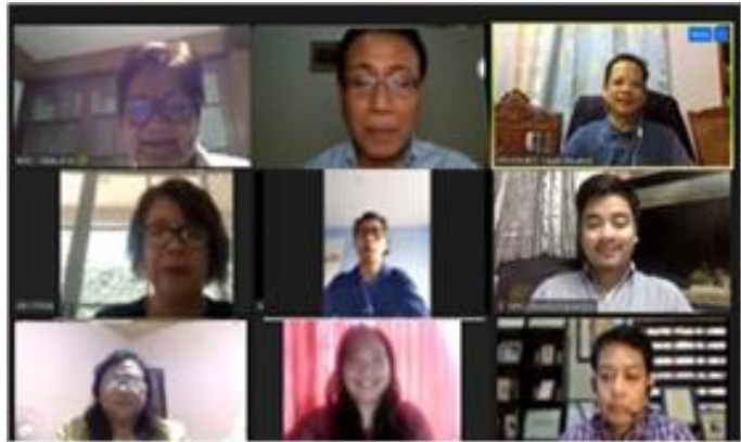
Figure 37. MSME Resilience and Recovery after COVID -19 webinar

The network, together with the NRC, and the Department of Trade and Industry Bureau of Small and Medium Enterprises Development (DTI - BSMED) organized a webinar to help small and medium businesses improve their business continuity plans (BCP) and help increase their organizational resilience to anticipated shocks and disruptions. More than 300 organizations participated in the webinar.