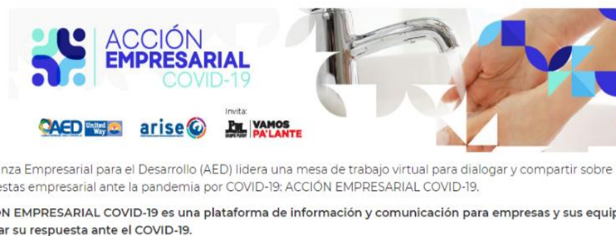
Figure 11. COVID-19 Business Action Platform announcement

emergency regulations, which were attended by over 200 companies. This exchange was key to support business operations during the crisis.