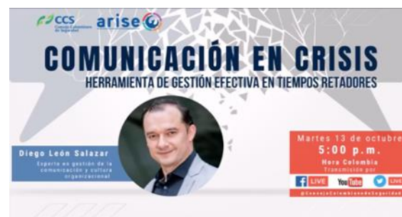
Figure 23. Forum announcement on ‘Communication in Crisis’ presenting an effective management tool

Furthermore, ARISE Colombia organized a podium discussion with ARISE Mexico to share knowledge and showcase the impact and achievements of ARISE in the region. The virtual event was viewed by 2,700 people.