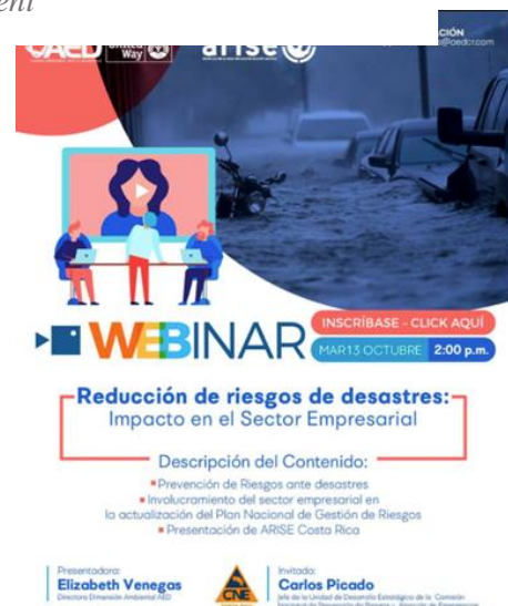
Figure 12. 'Disaster Risk Reduction: Business Sector impact' webinar

Finally, ARISE Costa Rica formalized an agreement with the National Insurance company , a public-private company, to work on the National DRR Plan and better integrate the insurance