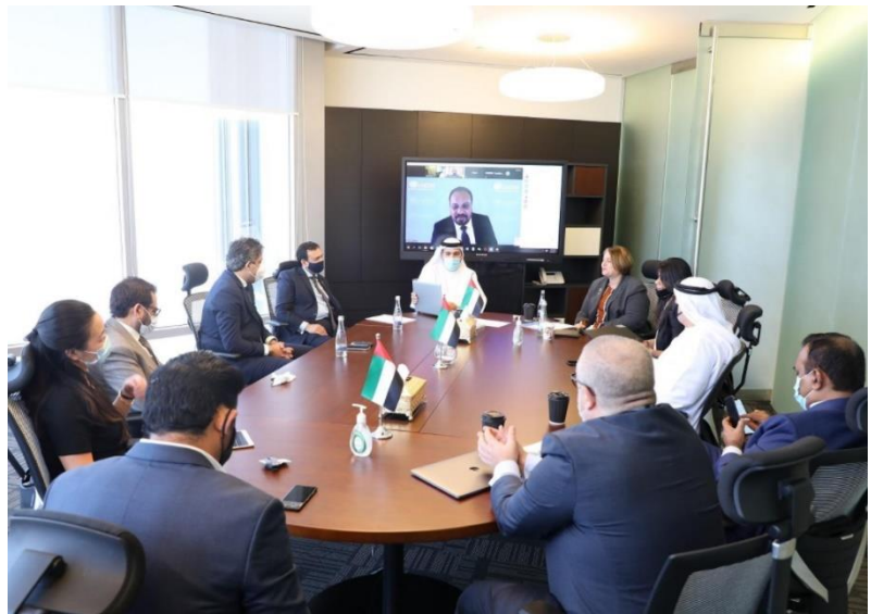
Figure 41. First Meeting of UAE ARISE