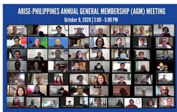
Figure 35. ARISE Philippines Annual General Membership Meeting