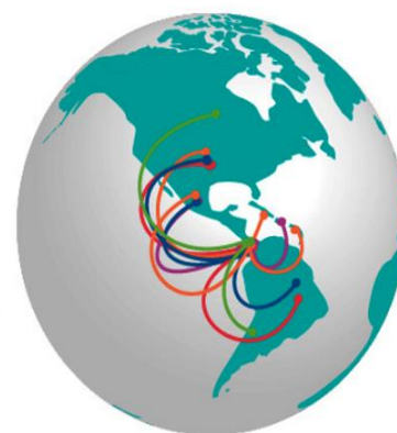
Figure 4. Graphic display of ARISE's impact in Americas & the Caribbean in 2020

Throughout the year, the networks proved to be a valuable space for peer-to-peer collaboration and knowledge sharing, especially in the context of COVID-19, supporting business communities in their countries not only to consider business continuity actions, but to also prevent the creation of risk and integrate multi-hazards approach within their operational plans.