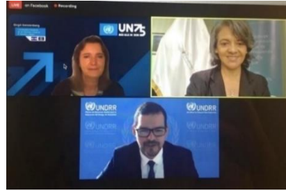
Figures 19 & 20. FUNDEMÁS virtual trainings and webinars promoting business resilience and DRR

In October 2020, ARISE El Salvador in coordination with UNDRR organized the private sector symposium for sustainable development. The event highlighted the role of the private sector in achieving sustainable development. In addition to the private sector, the event was attended by government authorities, and the international cooperation representatives, including the EU and UN agencies. The symposium included special sessions on DRR and the ARISE initiative. One of the sessions included a dialogue between UNDRR and companies from the food, logistics, and insurance sectors. The dialogue focused on how the private sector can ensure risk reduction and implement prevention measures in their internal processes. As a result, multiple stakeholders joined FUNDEMÁS and established the private-public alliance Unidos Somos Más , whose common strategy will focus on integrating the systemic risk approach to make El Salvador more resilient to disasters.