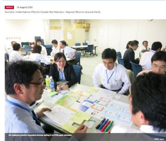
Figure 31. ARISE Japan’s stakeholder COVID-19 experience story