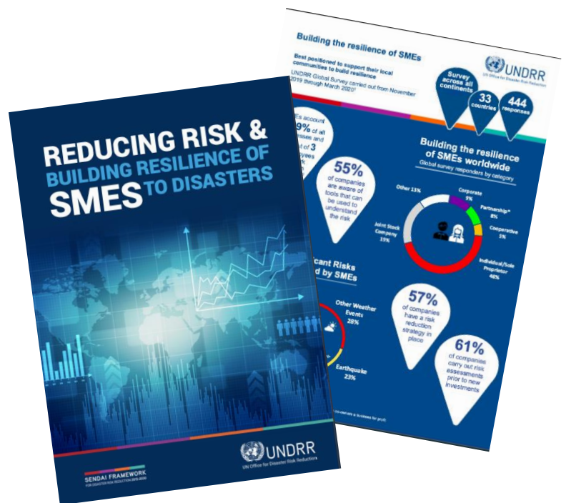
Figure 2 & 3. Guidance report on 'Reducing Risk & Building Resilience of SMEs to disasters'

The report is accompanied by an SMEs Resources Compendium, 6 sets of two-pagers with infographics, as well as a video about the report. The two-pagers showcase tailored statistics for the Caribbean, Central and South America, Mexico, India and the Philippines. A global two-pager provides a comprehensive view of the regions and country with aggregated data.