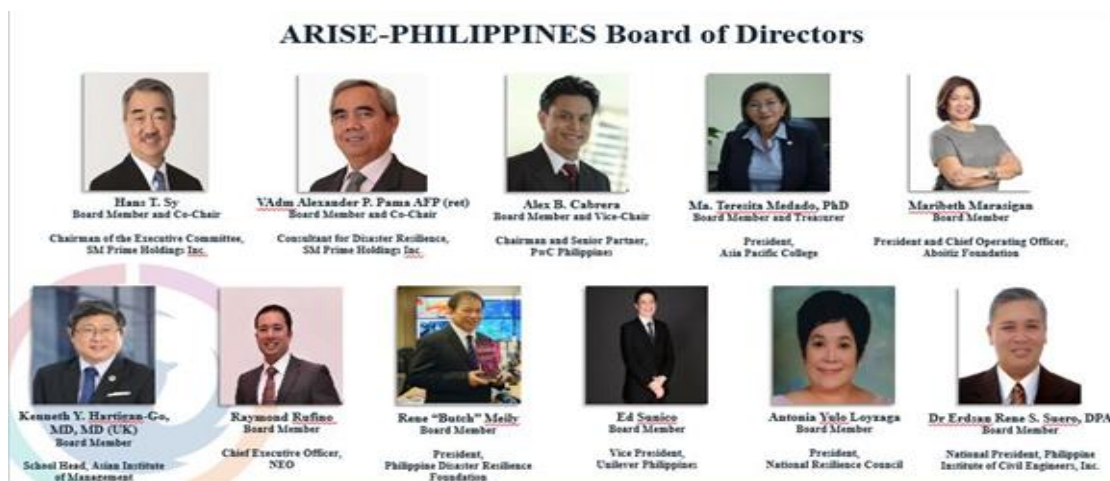
Figure 34. Diagram displaying ARISE-Philippines' Board of Directors