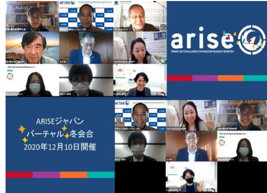
Figure 33. ARISE Japan Winter Meeting

The meeting included post-event review of the online symposium held in October (see above), and information-sharing on UNDRR-related activities, particularly the APMCDRR, as well as forward-looking brainstorming of possible events and activities in 2021. On the latter, it was agreed to plan the annual March public event as a virtual event, and to maximize the current online environment to engage with other ARISE networks in similar time zones.