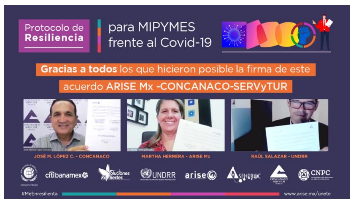
Figure 25. Celebratory announcement on the Voluntary Cooperation Agreements signing on the Resilience Protocol for SMES in the context of COVID-19

In addition, with support from UNDRR, Five Voluntary Cooperation Agreements were signed with strategic institutions such as: the Confederation of National Chambers of Commerce, Services and Tourism (CONCANACO SERVYTUR), the Alliance for Corporate Social Responsibility in Mexico (AliaRSE), the Mexican Chamber of the Construction Industry (CMIC), the Mexican Association of Insurance Institutions (AMIS), and the five regional nodes. Furthermore, UN Mexico and the National Coordination of Civil Protection participated as observers and allies (see Fig. 25).