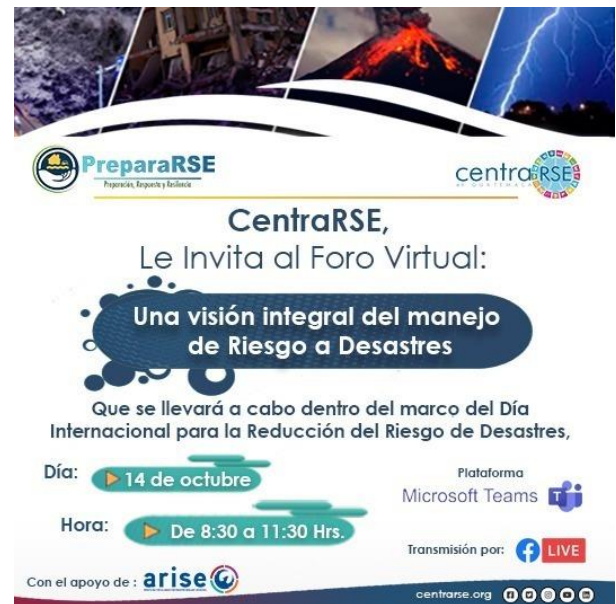
Figure 18. Virtual Forum invitation on disaster risk management.

In 2021, ARISE Guatemala aims to support SMEs resilience by engaging with key actors from the private and public sectors to promote the development of relevant policies. ARISE Guatemala will also work towards expanding the ARISE membership and facilitate further knowledge exchange.