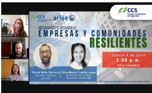
Figure 22. Webinar presenting ‘Resilient businesses & communities’ organized by CCS and ARISE Colombia

As one of the achievements, ARISE Colombia successfully promoted their partnership with the National Disaster Risk Management Unit (UNGRD) in order to enhance a broad and coherent business resilience strategy across the country in line with the National Action Plan for DRR and the ARISE global priorities. For this, in August 2020, ARISE Colombia, with UNDRR’s support, organized a forum to present a risk assessment tool for private sector companies to provide guidance on the development and implementation of Business Disaster Risk Management Plans (see Fig. 23).