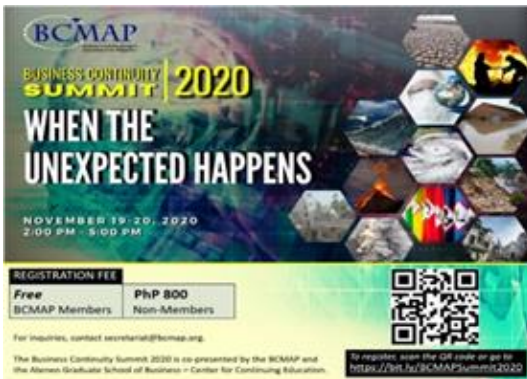
Figure 38. Business Continuity Summit 2020 flyer

The Business Continuity Managers Association of the Philippines ( BCMAP ) conducted its annual summit to discuss trends and issues related to establishing, improving, and sustaining robust and agile business continuity plans. Several members of the network participated in the online summit which was designed to reinforce the role of the private sector in building a more resilient Philippines (see Fig. 38).