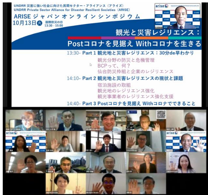
Figure 29. ARISE Japan Online Symposium

Efforts were activated in order to reach the tourism sector and utilize the event’s learnings, short recordings of the event were compiled and disseminated in November 2020. These recordings were subtitled in English as part of ARISE Japan’s dissemination efforts of good practices to global ARISE colleagues and the wider DRR community.