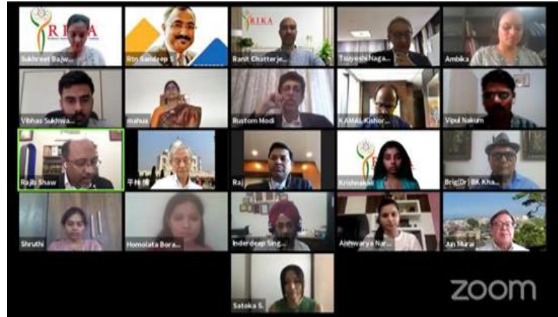
Figure 28. On-line Social Hackathon by ARISE INDIA and RIKKA

To unite innovators, mission-driven entrepreneurs, experts, and developers in finding unique solutions for tackling the issues of pandemic and future disasters to make the society resilient and sustainable, online social hackathon was created by ARISE India in partner with RIKKA (see Fig. 28). To ensure wider outreach and feasibility of innovative ideas/solutions, thematic mentors guided the specific groups through weekly sessions.