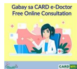
Figure 40. CARD MRI Social Media Cards: Response to COVID-19