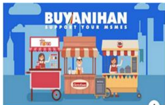
Figure 39. Buy Local Campaign “Buyanihan” flyer

To support small and medium businesses severely affected by the restrictions on travel and business operations, several members of the network, in collaboration with the Association of Filipino Franchisers, Inc. (AFFI), and the Department of Trade and Industry (DTI) organized the “ Buyanihan ” media campaign to encourage consumers to purchase locally made products (see Fig. 39).